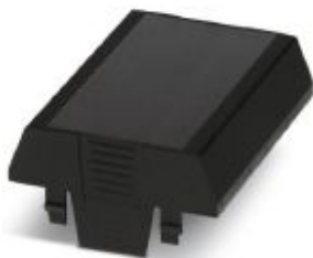
DIN rail housing, Upper part, tall design, without connection opening, width: 90.1 mm, height: 75.27 mm, depth: 36.95 mm, color: black (9005)

Please be informed that the data shown in this PDF Document is generated from our Online Catalog. Please find the complete data in the user's documentation. Our General Terms of Use for Downloads are valid ( http://phoenixcontact.com/download )