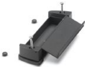
Profile housing, Side part, length: 15 mm, width: 124.4 mm

Please be informed that the data shown in this PDF Document is generated from our Online Catalog. Please find the complete data in the user's documentation. Our General Terms of Use for Downloads are valid ( http://phoenixcontact.com/download )