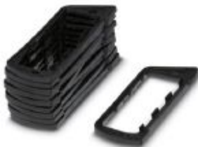
EMC seal for HC-ALU panel mounting base

Please be informed that the data shown in this PDF Document is generated from our Online Catalog. Please find the complete data in the user's documentation. Our General Terms of Use for Downloads are valid ( http://phoenixcontact.com/download )