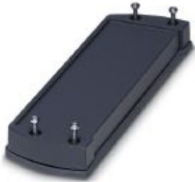
Profile housing, Side part, width: 190.4 mm

Please be informed that the data shown in this PDF Document is generated from our Online Catalog. Please find the complete data in the user's documentation. Our General Terms of Use for Downloads are valid ( http://phoenixcontact.com/download )