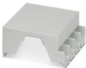
DIN rail housing, Upper housing part for connectors with header, width: 90.4 mm, height: 99 mm, depth: 45.85 mm, color: light gray (7035)

Please be informed that the data shown in this PDF Document is generated from our Online Catalog. Please find the complete data in the user's documentation. Our General Terms of Use for Downloads are valid ( http://phoenixcontact.com/download )