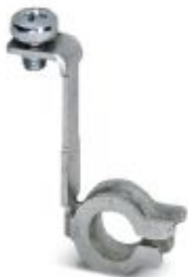
PE contact for UM-PRO panel mounting base for connecting the PCB to the DIN rail at level 2

Please be informed that the data shown in this PDF Document is generated from our Online Catalog. Please find the complete data in the user's documentation. Our General Terms of Use for Downloads are valid ( http://phoenixcontact.com/download )