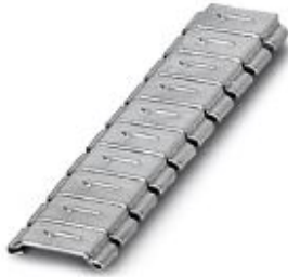
Marking collar, Labeled with the number: Numbers, silver, width: 5.5 mm

Please be informed that the data shown in this PDF Document is generated from our Online Catalog. Please find the complete data in the user's documentation. Our General Terms of Use for Downloads are valid ( http://phoenixcontact.com/download )