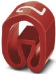
Conductor marking collar, Labeled with the number: Numbers, red, width: 4.2 mm

Please be informed that the data shown in this PDF Document is generated from our Online Catalog. Please find the complete data in the user's documentation. Our General Terms of Use for Downloads are valid ( http://phoenixcontact.com/download )