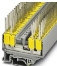
Feed-through terminal block, connection method: Slip-on connection, cross section: 0.5 mm 2 - 6 mm 2 , AWG: 20 - 10, width: 6.2 mm, color: gray, mounting: NS 35/7,5, NS 35/15, NS 32

Please be informed that the data shown in this PDF Document is generated from our Online Catalog. Please find the complete data in the user's documentation. Our General Terms of Use for Downloads are valid ( http://phoenixcontact.com/download )