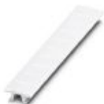
Zack marker strip, can be ordered: Strip, white, labeled according to customer specifications, mounting type: snap into tall marker groove, for terminal block width: 6.2 mm, lettering field size: 6.15 x 10.5 mm, Number of individual labels: 10

Zack marker strip - ZB 6,LGS:FORTL.ZAHLEN - 1051016