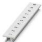
Zack marker strip, Strip, white, labeled, can be labeled with: CMS-P1-PLOTTER, printed horizontally: consecutive numbers 1 ... 10, 11 ... 20, etc. up to 491 ... 500, mounting type: snap into tall marker groove, for terminal block width: 6.2 mm, lettering field size: 6.15 x 10.5 mm, Number of individual labels: 10

Zack marker strip - ZB 6,LGS:FORTL.ZAHLEN - 1051016