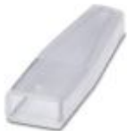
Insulating sleeve, as touch protection, slide onto the conductor before for 6.3 slip-on sleeves