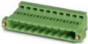
The figure shows an 10-position version

Please be informed that the data shown in this PDF Document is generated from our Online Catalog. Please find the complete data in the user's documentation. Our General Terms of Use for Downloads are valid ( http://phoenixcontact.com/download )