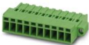
The figure shows an 10-position version

PCB connector, nominal current: 12 A, rated voltage (III/2): 320 V, nominal cross section: 2.5 mm 2 , number of positions: 12, pitch: 5.08 mm, connection method: Crimp connection, color: green, Corresponding female crimp contacts with current [A] and conductor cross section range [mm 2 ] data: 10A/MSTBC-MT 0,5-1,0 (3190564); 10A/MSTBC-MT 0,5-1,0 BA (3190645); 12A/MSTBC-MT 1,5-2,5 (3190551); 12A/MSTBC-MT 1,5-2,5 BA (3190658). BA = Bandkontakte