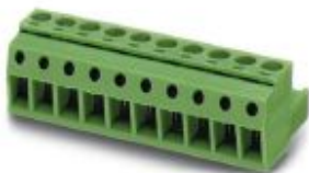
The figure shows a 10-position version of the product

PCB connector, nominal current: 12 A, rated voltage (III/2): 320 V, nominal cross section: 2.5 mm 2 , number of positions: 15, pitch: 5 mm, connection method: Screw connection with tension sleeve, color: green, contact surface: Tin