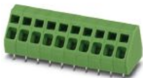
The figure shows the 10-pos. standard item

PCB terminal block, nominal current: 24 A, rated voltage (III/2): 400 V, nominal cross section: 2.5 mm 2 , pitch: 5.08 mm, number of positions: 4, connection method: Spring-cage connection, mounting: Wave soldering, conductor/PCB connection direction: 45 °, color: green, Pin layout: Linear double pinning, Solder pin [P]: 3.5 mm