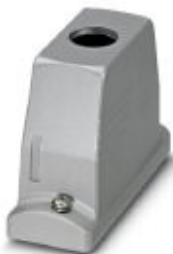
HEAVYCON ADVANCE EMC sleeve housing B24, with screw locking, height 100 mm, with 1xM40 support, and straight cable outlet

Please be informed that the data shown in this PDF Document is generated from our Online Catalog. Please find the complete data in the user's documentation. Our General Terms of Use for Downloads are valid ( http://phoenixcontact.com/download )