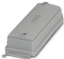
Protective cover B24, Clip locking, protective cover material: PA, height: 31.2 mm, seal: no, with lanyard, diameter of retaining cord eyelet: 4 mm

Please be informed that the data shown in this PDF Document is generated from our Online Catalog. Please find the complete data in the user's documentation. Our General Terms of Use for Downloads are valid ( http://phoenixcontact.com/download )