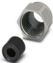
D-SUB cap nut with line seal, for conductor diameter of 5 mm ... 10 mm, for sleeve housing VS-15-...

Please be informed that the data shown in this PDF Document is generated from our Online Catalog. Please find the complete data in the user's documentation. Our General Terms of Use for Downloads are valid ( http://phoenixcontact.com/download )