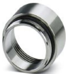
NPT adapter, IP68, up to 5 bar, incl. O-ring seal, M40 to 1 1/4"

Please be informed that the data shown in this PDF Document is generated from our Online Catalog. Please find the complete data in the user's documentation. Our General Terms of Use for Downloads are valid ( http://phoenixcontact.com/download )