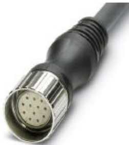
M23 socket, straight, 12-pos., with 5 m master cable, pin 9 and 10 bridged

Please be informed that the data shown in this PDF Document is generated from our Online Catalog. Please find the complete data in the user's documentation. Our General Terms of Use for Downloads are valid ( http://phoenixcontact.com/download )