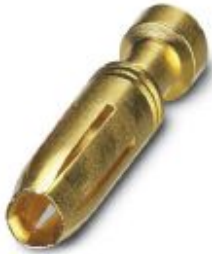
Turned 2.5 crimp contact, individual female contact, core diameter 0.5 mm 2 , gold-plated

Please be informed that the data shown in this PDF Document is generated from our Online Catalog. Please find the complete data in the user's documentation. Our General Terms of Use for Downloads are valid ( http://phoenixcontact.com/download )