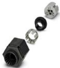
Locking nut, can only be released with Allen wrench, coding 2

Please be informed that the data shown in this PDF Document is generated from our Online Catalog. Please find the complete data in the user's documentation. Our General Terms of Use for Downloads are valid ( http://phoenixcontact.com/download )