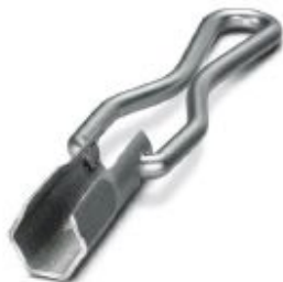
Socket wrench, for tightening and unscrewing the QUICKON union nut, wrench size 19 mm

Please be informed that the data shown in this PDF Document is generated from our Online Catalog. Please find the complete data in the user's documentation. Our General Terms of Use for Downloads are valid ( http://phoenixcontact.com/download )