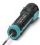
Assembly tool, for CK 1.6... crimp contacts for small conductor cross sections

Assembly tool - UNIFOX MT-CK 1.6/2.5 - 1089092