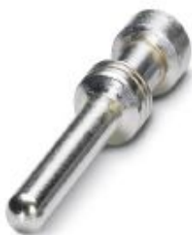
Turned 2.5 crimp contact, individual male contact, core diameter 4.00 mm 2 , silver-plated

Please be informed that the data shown in this PDF Document is generated from our Online Catalog. Please find the complete data in the user's documentation. Our General Terms of Use for Downloads are valid ( http://phoenixcontact.com/download )