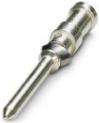
Turned 1.6 crimp contact, individual male contact, core diameter 0.75 mm 2 , silver-plated

Please be informed that the data shown in this PDF Document is generated from our Online Catalog. Please find the complete data in the user's documentation. Our General Terms of Use for Downloads are valid ( http://phoenixcontact.com/download )