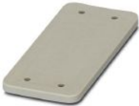
HEAVYCON cover plate, for wall cutouts of type D15, 3.5 mm thick, gray

Please be informed that the data shown in this PDF Document is generated from our Online Catalog. Please find the complete data in the user's documentation. Our General Terms of Use for Downloads are valid ( http://phoenixcontact.com/download )