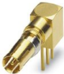
Coaxial contact, for D-SUB combination inserts, for PCB assembly, pin, angled, gold-plated

Please be informed that the data shown in this PDF Document is generated from our Online Catalog. Please find the complete data in the user's documentation. Our General Terms of Use for Downloads are valid ( http://phoenixcontact.com/download )