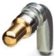
POWER contact, for D-SUB combination inserts, for PCB assembly, pin, angled, rated current 40 A, gold-plated

Please be informed that the data shown in this PDF Document is generated from our Online Catalog. Please find the complete data in the user's documentation. Our General Terms of Use for Downloads are valid ( http://phoenixcontact.com/download )