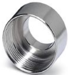
Step-up adapter, M20 to M25, including O-ring

Please be informed that the data shown in this PDF Document is generated from our Online Catalog. Please find the complete data in the user's documentation. Our General Terms of Use for Downloads are valid ( http://phoenixcontact.com/download )