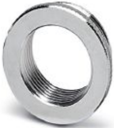
Reducing adapter, material: Brass, nickel-plated, connecting thread: M40 x 1.5, color: silver, with O-ring

Please be informed that the data shown in this PDF Document is generated from our Online Catalog. Please find the complete data in the user's documentation. Our General Terms of Use for Downloads are valid ( http://phoenixcontact.com/download )