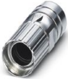
Cable connector, CA, straight, shielded: yes, Screw locking, M23, cable diameter range: 10 mm ... 14.5 mm

Please be informed that the data shown in this PDF Document is generated from our Online Catalog. Please find the complete data in the user's documentation. Our General Terms of Use for Downloads are valid ( http://phoenixcontact.com/download )