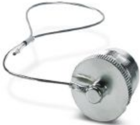
Metal protection cap with steel wire and loop, for M23 power and hybrid connectors with knurled nut for fastening to the cable

Please be informed that the data shown in this PDF Document is generated from our Online Catalog. Please find the complete data in the user's documentation. Our General Terms of Use for Downloads are valid ( http://phoenixcontact.com/download )