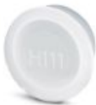
Plastic protection cap for connectors with M23 knurled nut