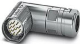
The figure shows the 12-pos. product version with solder contacts

Cable connector, CA, angled, shielded: yes, SPEEDCON locking, M23, No. of pos.: 16+2+PE, type of contact: Pin, Crimp connection, cable diameter range: 4 mm ... 6 mm