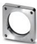
Square mounting flange, Axial seal, 4xM3, flange dimensions: 35 mm x 35 mm

Square mounting flange - RF-Z0003 - 1607905