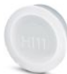
Plastic protection cap for connectors with M23 knurled nut