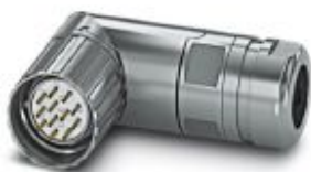
The figure shows the 12-pos. product version with solder contacts

Cable connector, CA, angled, shielded: yes, Screw locking, M23, No. of pos.: 16+2+PE, type of contact: Pin, Crimp connection, cable diameter range: 4 mm ... 6 mm