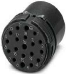
Contact insert, number of positions: 16+2+PE, type of contact: Pin, Crimp connection

Please be informed that the data shown in this PDF Document is generated from our Online Catalog. Please find the complete data in the user's documentation. Our General Terms of Use for Downloads are valid ( http://phoenixcontact.com/download )