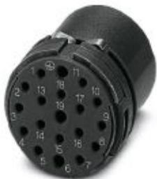
Contact insert, number of positions: 16+2+PE, type of contact: Socket, Crimp connection

Please be informed that the data shown in this PDF Document is generated from our Online Catalog. Please find the complete data in the user's documentation. Our General Terms of Use for Downloads are valid ( http://phoenixcontact.com/download )