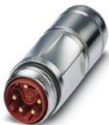
Coupling connector, SB, straight long, shielded: yes, for standard and SPEEDCON interlock, M40, No. of pos.: 8+4+PE, type of contact: Pin, Crimp connection, cable diameter range: 14 mm ... 20.5 mm

Please be informed that the data shown in this PDF Document is generated from our Online Catalog. Please find the complete data in the user's documentation. Our General Terms of Use for Downloads are valid ( http://phoenixcontact.com/download )