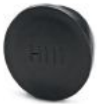
Plastic protection cap, antistatic, for connectors with M23 knurled nut

Plastic anti-static dust protection cap - RC-Z2468 - 1611796