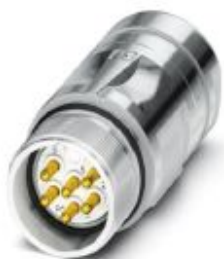
Coupling connector, CA, straight, shielded: yes, for standard and SPEEDCON interlock, M23, No. of pos.: 8+1, type of contact: Pin, Crimp connection, cable diameter range: 3 mm ... 14.5 mm

Please be informed that the data shown in this PDF Document is generated from our Online Catalog. Please find the complete data in the user's documentation. Our General Terms of Use for Downloads are valid ( http://phoenixcontact.com/download )