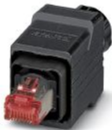
RJ45 connector, IP67, with push/pull interlocking (version 14), plastic housing, for 1 Gigabit, for 24 ... 25 AWG stranded conductors

Please be informed that the data shown in this PDF Document is generated from our Online Catalog. Please find the complete data in the user's documentation. Our General Terms of Use for Downloads are valid ( http://phoenixcontact.com/download )