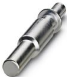
Crimp contact, turned, contact diameter: 10 mm, crimp range: 16 mm 2 ... 16 mm 2

Please be informed that the data shown in this PDF Document is generated from our Online Catalog. Please find the complete data in the user's documentation. Our General Terms of Use for Downloads are valid ( http://phoenixcontact.com/download )