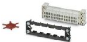
The figure shows the 40-pos. version

Contact insert set for mounting side, sleeve frame with PE, 4 fixing screws, 8-pos. contact inserts preassembled, 6 coding profiles, 2 mounting flanges