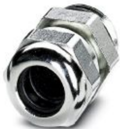
Cable gland, shielded: no, cable diameter range: 6.5 mm ... 9.5 mm

Please be informed that the data shown in this PDF Document is generated from our Online Catalog. Please find the complete data in the user's documentation. Our General Terms of Use for Downloads are valid ( http://phoenixcontact.com/download )