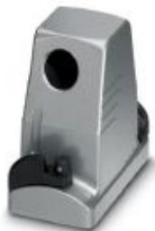
HEAVYCON ADVANCE standard powder-coated, sleeve housing B6, with bayonet locking, height 100 mm, with 1xM25 thread, lateral cable outlet

Please be informed that the data shown in this PDF Document is generated from our Online Catalog. Please find the complete data in the user's documentation. Our General Terms of Use for Downloads are valid ( http://phoenixcontact.com/download )