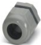
Cable gland, cable gland material: PA, external cable diameter 6 mm ... 12 mm, shielding: no, connecting thread: M20 x 1.5, color: silver-gray RAL 7001

Cable gland - G-INS-M20-S68N-PNES-GY - 1411125