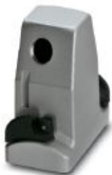
HEAVYCON ADVANCE EMV sleeve housing B6, with bayonet locking, height 100 mm, with 1xM20 thread, lateral cable outlet

Please be informed that the data shown in this PDF Document is generated from our Online Catalog. Please find the complete data in the user's documentation. Our General Terms of Use for Downloads are valid ( http://phoenixcontact.com/download )