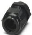
Cable gland, cable gland material: PA, external cable diameter 6 mm ... 12 mm, shielding: no, connecting thread: M20 x 1.5, color: jet black RAL 9005

Cable gland - G-INS-M20-S68N-PNES-BK - 1411133