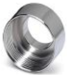
Step-up adapter, M20 to M25, including O-ring

Extension adapter - ENLAR-M-KV-M20/M25 - 1647666