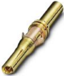
Crimp contact, turned, contact diameter: 1 mm, crimp range: 0.75 mm 2 ... 1 mm 2

Please be informed that the data shown in this PDF Document is generated from our Online Catalog. Please find the complete data in the user's documentation. Our General Terms of Use for Downloads are valid ( http://phoenixcontact.com/download )