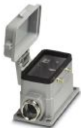
Box mounting base, for double locking latch, height 52 mm, with screw connection, 2x M20, with protective cover

Please be informed that the data shown in this PDF Document is generated from our Online Catalog. Please find the complete data in the user's documentation. Our General Terms of Use for Downloads are valid ( http://phoenixcontact.com/download )