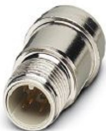
Sensor/actuator flush-type plug, 5-pos., M12, A-coded, front/press-in mounting, with straight solder connection

Please be informed that the data shown in this PDF Document is generated from our Online Catalog. Please find the complete data in the user's documentation. Our General Terms of Use for Downloads are valid ( http://phoenixcontact.com/download )