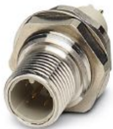
Sensor/Actuator flush-type plug, 5-pos., M12, A-coded, rear/screw mounting with Pg9 thread, with straight solder connection

Please be informed that the data shown in this PDF Document is generated from our Online Catalog. Please find the complete data in the user's documentation. Our General Terms of Use for Downloads are valid ( http://phoenixcontact.com/download )