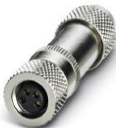
Connector, Universal, 4-position, shielded, Socket straight M8, Coding: A, Solder connection, knurl material: Nickel-plated brass, external cable diameter 3.5 mm ... 5 mm

Please be informed that the data shown in this PDF Document is generated from our Online Catalog. Please find the complete data in the user's documentation. Our General Terms of Use for Downloads are valid ( http://phoenixcontact.com/download )