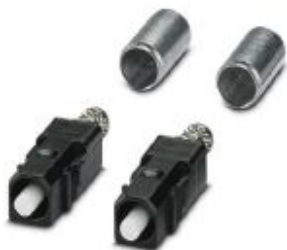
Fiber optic contact insert, degree of protection: IP20, cable outlet: straight

Please be informed that the data shown in this PDF Document is generated from our Online Catalog. Please find the complete data in the user's documentation. Our General Terms of Use for Downloads are valid ( http://phoenixcontact.com/download )