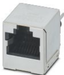
RJ45 PCB connectors, degree of protection: IP20, 10 Gbps

Please be informed that the data shown in this PDF Document is generated from our Online Catalog. Please find the complete data in the user's documentation. Our General Terms of Use for Downloads are valid ( http://phoenixcontact.com/download )